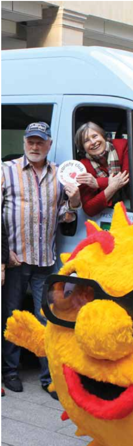
Received a new bus for disabled children from the Variety Club!

Collected 1,750 signatories on our online petition against Arts Council Cuts